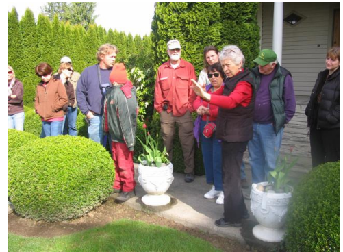
Backyard Wildlife Habitat tour