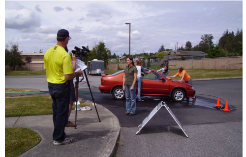
Making of the video