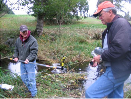
Skagit Stream Team