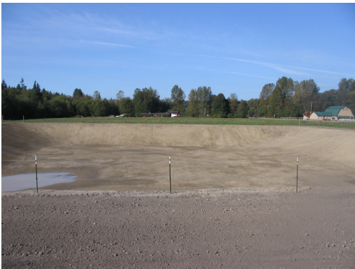
Waste storage pond