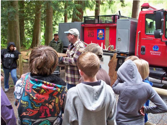
Sixth Grade Conservation Tour