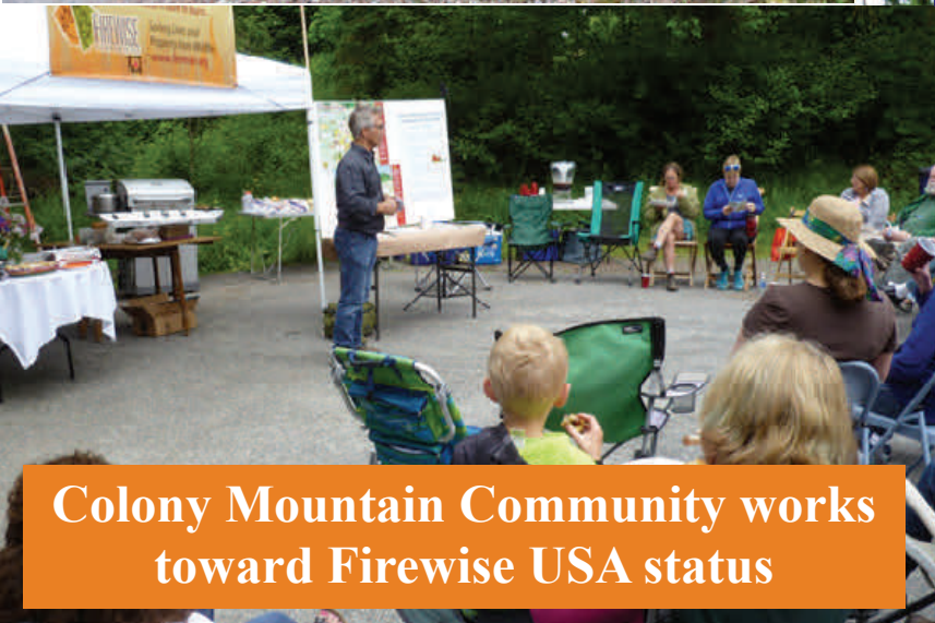
Colony Mountain Community works toward Firewise USA status