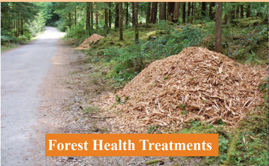
Forest Health Treatments

Chuckanut Ridge, Shelter Bay, Butler Hill, Newhalem, Diablo, Diobsud, Cascade River, Jenkins Lane.