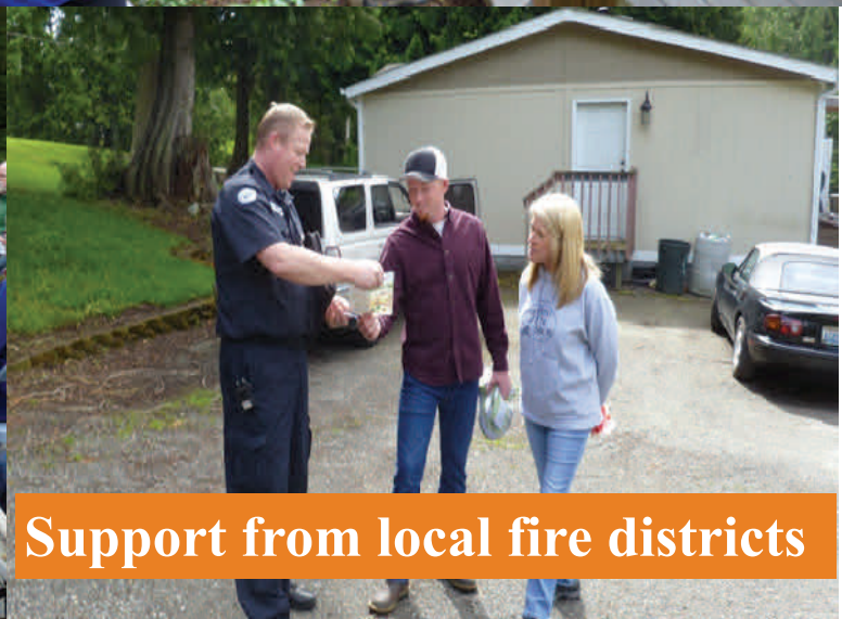
Support from local fire districts