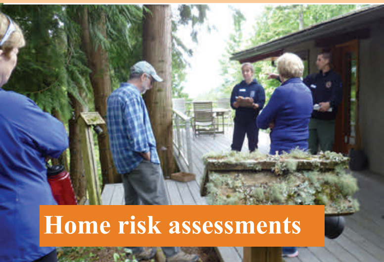
Home risk assessments