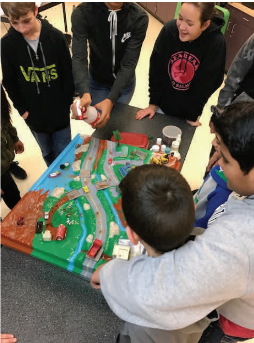
Photo – Students become storm clouds as they rain on the watershed model during a presentation

These free presentations, which are offered to Skagit County schools and local organizations, provide a unique, interactive learning experience, enabling students to make the connection between the way we live and the health of our local waterways. They are able to see how the combined affects of non-point source pollution from many small sources can have a large impact on the quality of our shared water resources. Students discover how they can protect the environment by taking small, local actions and gain knowledge about stormwater runoff, water pollution, water quality, watersheds, and stewardship.