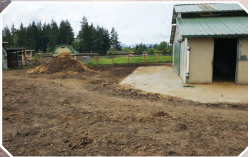
Before – Photo of manure and used bedding material stored on bare ground and uncovered.