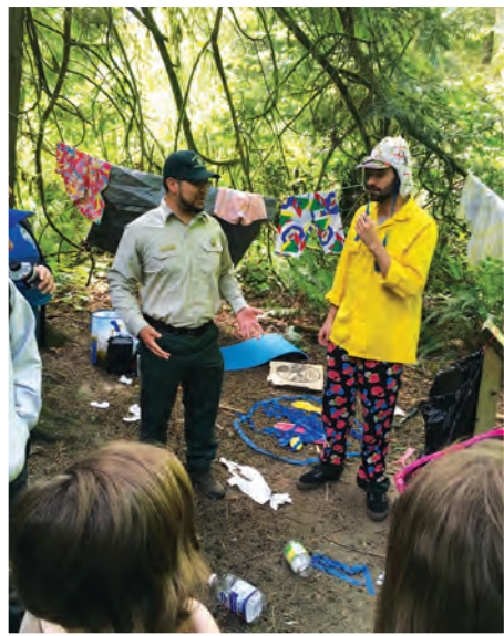
At left: U.S. Forest Service staff act out the effects of the "Impact Monster" to demonstrate the wrong way to camp and teach proper camping practices to students.

This year's annual Skagit Conservation Youth Tour welcomed 750 fifth and sixth grade students from 28 Skagit County classrooms to Pomona Grange Park on Friday Creek May 10 th and 11 th . Sunny weather welcomed students who participated in hand-on activities offered by local resource professionals. Stations included: forest protection, the salmon life cycle, bivalves, soils, "Leave No Trace" camping practices, and forest regeneration. Classes that participated in the "Zero Waste" recycling lunch activity reduced landfill waste by 77%!!