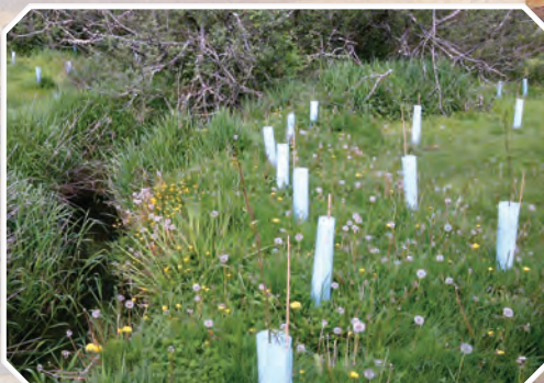
After: The same creek planted with native vegetation that will provide shade and habitat for salmon and other species as it matures.