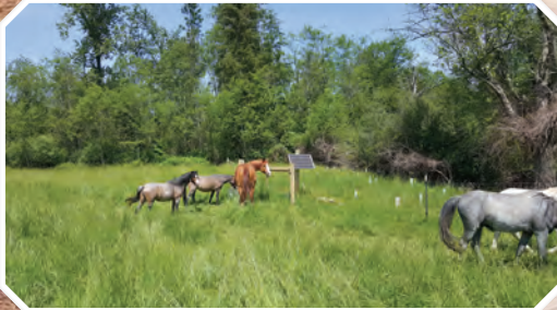
Horses drinking water supplied by a solar powered water pump system. Prior to the installation of the riparian buffer, fencing and the pump system, the horses accessed a creek to obtain drinking water.

W ith assistance from our small farm, livestock, and CREP planners, landowners in Skagit County have been working hard to implement best management practices on their properties. These practices are cost-shared through funds available at the District that help pay for labor and materials, as well as maintenance in some cases. Below are photos from projects happening around the county that help reduce pollution potential to our waterways, improve the health and well-being of animals, and support wildlife habitat improvement.