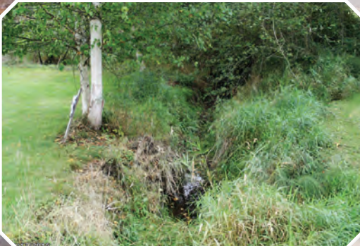
Before: A salmon bearing stream with very little planted riparian area.