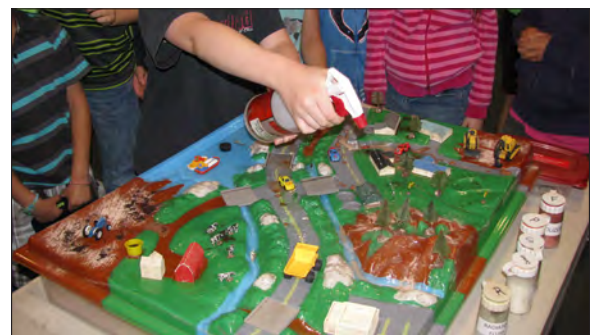
Students "make it rain" on the watershed model during a presentation