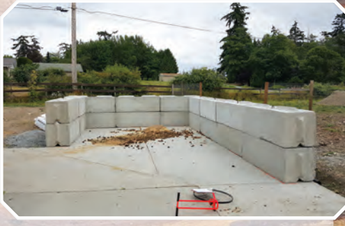
After: Photo of the completed manure storage bin. The landowner will cover the manure pile with a tarp to divert rainwater away from the manure.