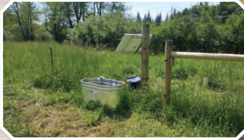
Photo of the second solar powered water pump system installed on the same property, but on the other side of the creek.