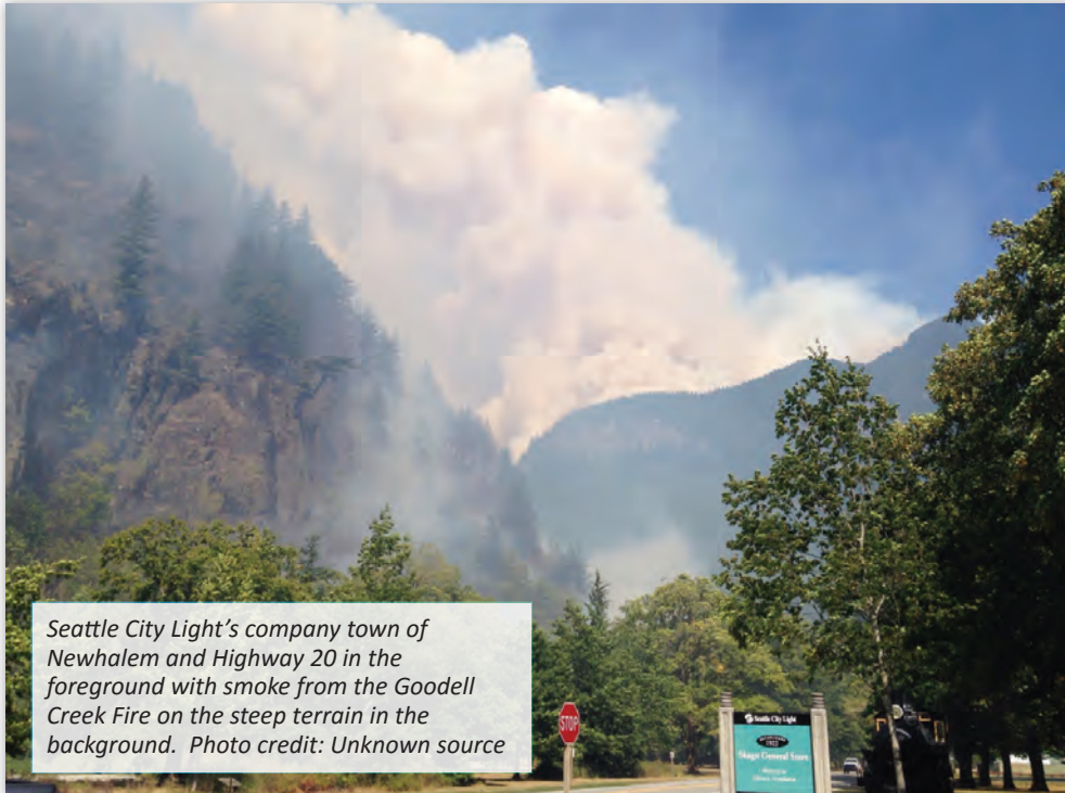
Seattle City Light's company town of Newhalem and Highway 20 in the foreground with smoke from the Goodell Creek Fire on the steep terrain in the background.

My colleague, Dr. Crystal Raymond, in Seattle City Light's Environmental Affairs department is working on a project with the North Cascades National Park and the Forest Service to do some fuels treatment modeling for key in the park and near Seattle City Light's infrastructure. This project is funded through the WAFAC Learning Network. It is important to have some science to guide our work in order to ensure that what we are doing is most effective!